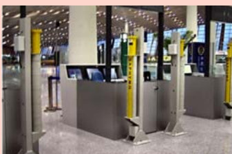
Radiological control for pedestrian