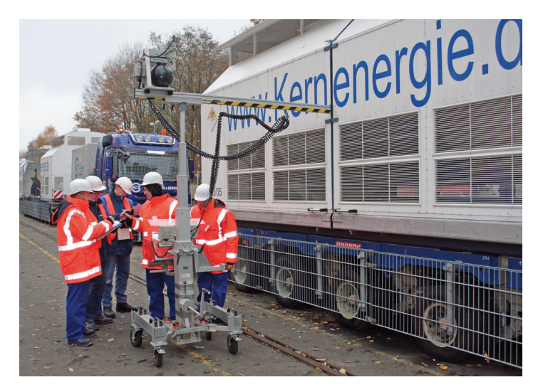
Figure 3: Neutron measurement during CASTOR transport

The LB 6411 operates virtually independent of the radiation direction. This is made possible by the optimized spherical geometry of the moderator and counter tube. In the energy range between 1 MeV and 20 MeV, it results in a directional deviation of less than \pm 10\% from the preferred direction over the entire angular range. In the lower hemisphere the directional dependence remains below 10% even at low neutron energies.