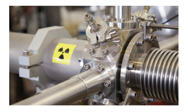
Designed for high-sensitivity

High flexibility. Best-in-class sensitivity.