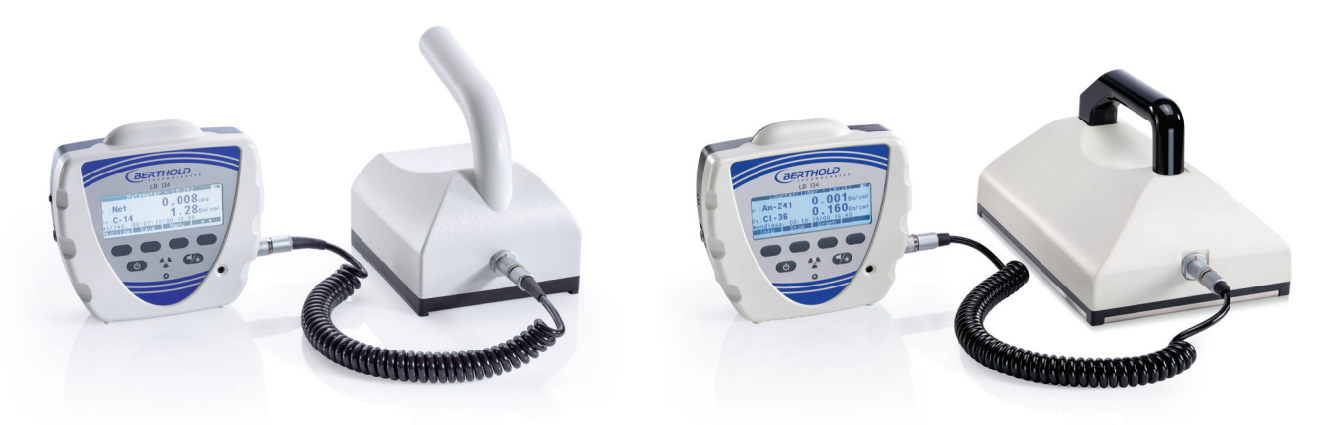
Figure 7: Two different scintillator probes are available: LB 1342 with 170 cm<sup>2</sup> area (left) and LB 1343 with 345 cm<sup>2</sup> area (right).