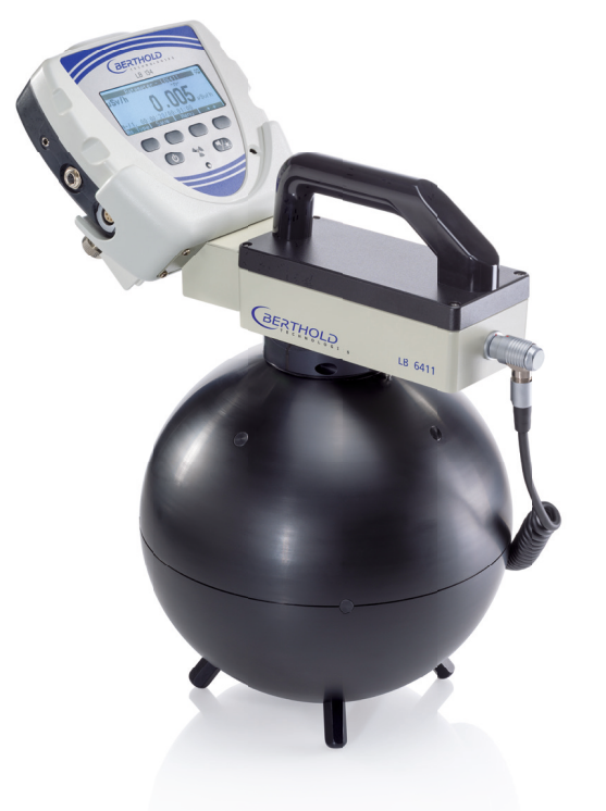
Figure 2: Mobile measurement setup of LB 134 UMo II connected to LB 6411 Neutron Dose Rate Probe.

The LB 134 performs its task as a dose and dose rate meter excellently in gamma, X-ray and neutron radiation fields. This is why the UMo II is a reliable partner for quick detection of any increase in dose rate at the workplace.