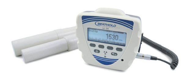
Figure 5: In combination with the LB 1234, the UMo II LB 134 offers a powerful mobile system for detecting radioactive gamma sources.