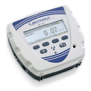
Figure 1: LB 134 UMo II base unit. Its software offers numerous measuring modes and parameter settings