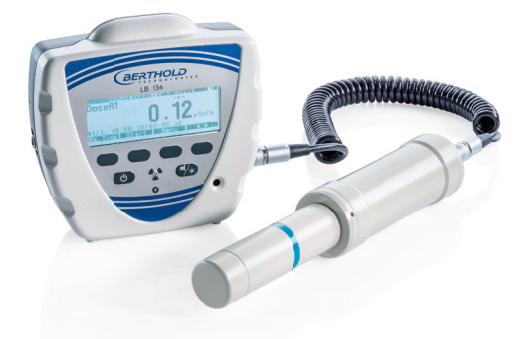
Figure 3: Portable combination of the LB 134 UMo II with the LB 1236-H10 gamma probe.