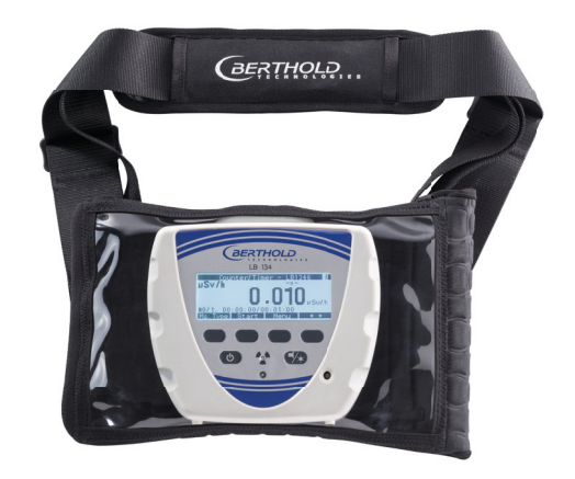
Figure 9: A practical bag with carrying strap is available for the LB 134.