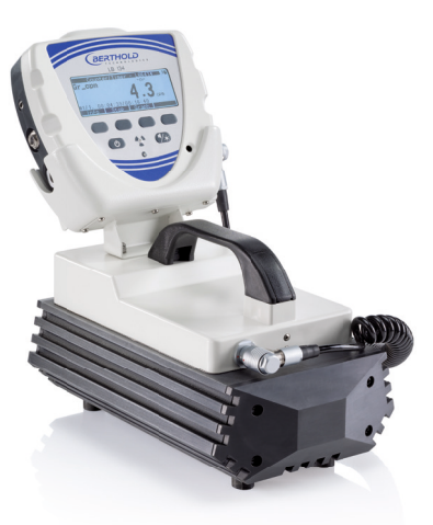
Figure 4: The LB 134 can be used as a portable neutron survey meter in combination with the LB 6414.